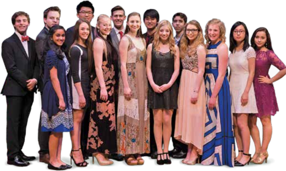
Members of the 2016 Class of Young Masters

Since its inception in 2002, the Trust has given 278 SCHOLARSHIP GRANTS to 139 PREVIOUS YOUNG MASTERS , AWARDING $857,500 to aspiring artists from across the state.