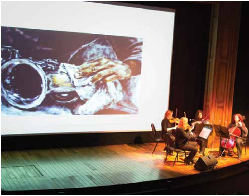
Tosca String Quartet performs while artwork by 2016 Young Masters plays in the background.